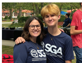
SGA hosting Welcome Week activities.