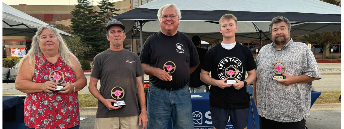
Winners Photo. Division winner from left to right: Classic, Exotic, Muscle, Student, and Vintage.

SGA will be hosting a Halloween movie showing in the Courtyard/HUB on the Friday before Halloween. Movie choice is yet to be determined via student voting.